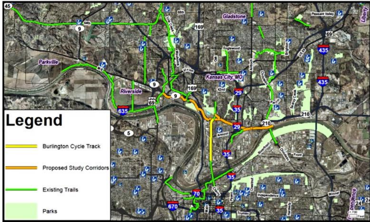
Multi-County Regional Bike/Ped Highway Barrier Removal Project (Missouri River Trail Connector)

Approval was given to authorize a feasibility study for a recreational trail along the levee.